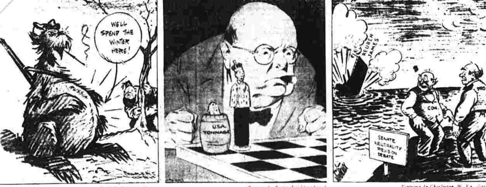
"The German General Staff Reaches An Important Decision" "Churbell's Worry" "What Will Hitler Do?" "Adolf Settles The Argument"